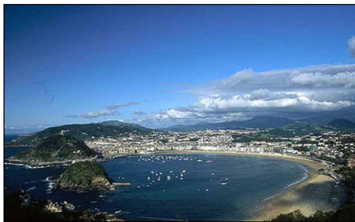
The Beautiful San Sebastian, Spain